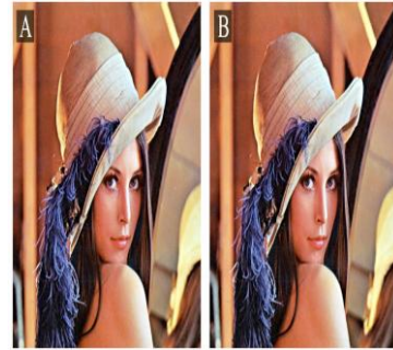
Fig. 3. A. Original image; B. Stego image

PRNG. Then, message bits were embedded at the random-edge area pixel locations and smooth area pixel locations using modified LSB insertion algorithm. Fig. 3 presents the results of applying this technique to standard image Lena and cumulative results analysis is presented in Table I.